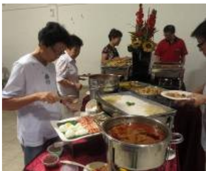
Helping ourselves to the sumptuous spread