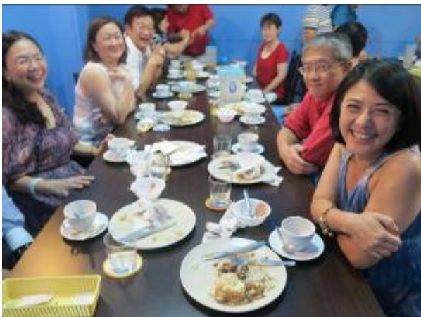
Hilarity over the mess made after lights came back on

After dinner the lights came on and we were amazed at the mess we had made on the dinner table. We could not help but laugh at ourselves. This was indeed an experience we will never forget.